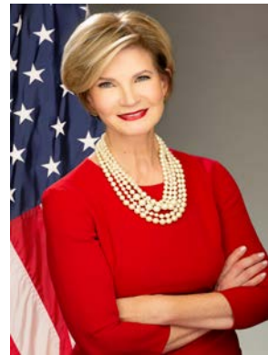
Commissioner Rebecca F. Dye Appointed 2002 Term Expires 2020