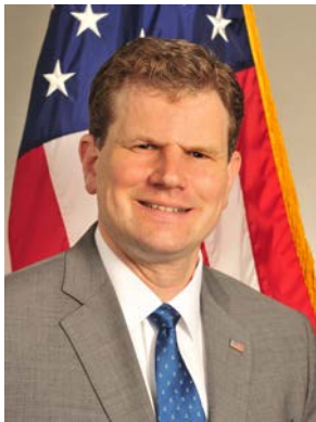
Commissioner Daniel B. Maffei Appointed 2016 Term Expires 2022