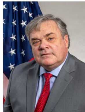
Commissioner Carl Bentzel Appointed 2019 Term Expires 2024