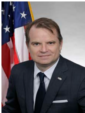
Commissioner Louis E. Sola Appointed 2019 Term Expires 2023